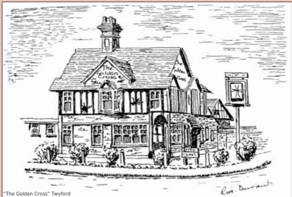
"The Golden Cross" Twyford

The designation of a conservation area helps to identify these important local characteristics and ensure they are properly considered if changes are proposed.