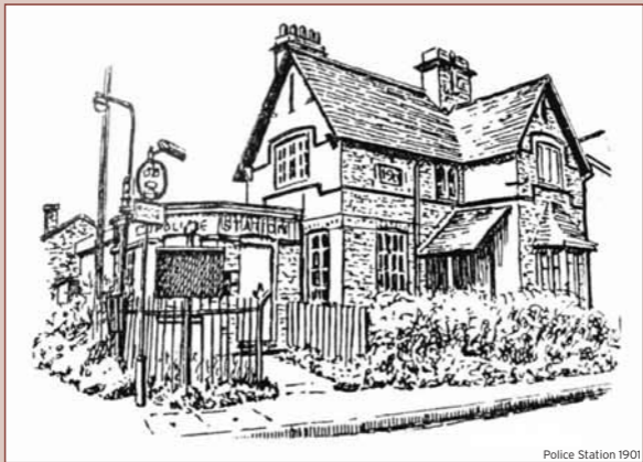
Police Station 1901

Twyford Station Conservation Area was designated in June 1996. This leaflet shows the extent of the area and explains the responsibilities of Wokingham Borough Council and property owners within the Conservation Area.